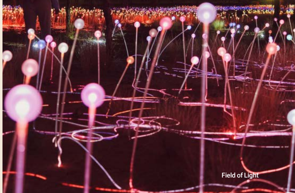
Field of Light