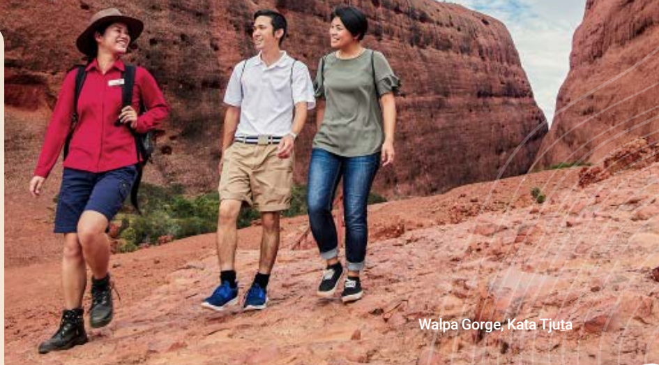
Walpa Gorge, Kata Tjuta

Prices do not include National Park Pass (see back page for details)