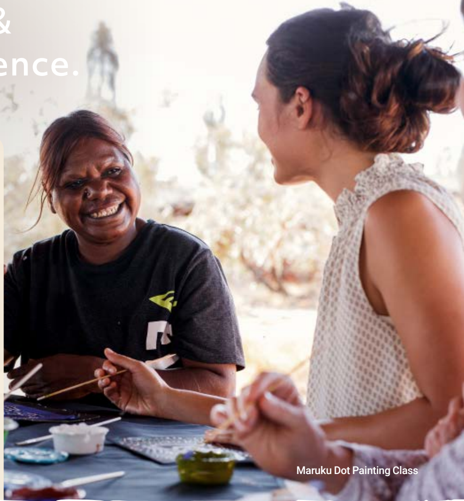
Maruku Dot Painting Class